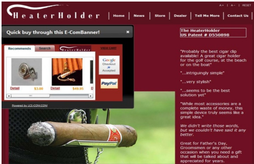
Figure 1: An ad-tag serves wrapper to waiting site, then calls the Flash file (SWF) containing the ad content from a LCE server.